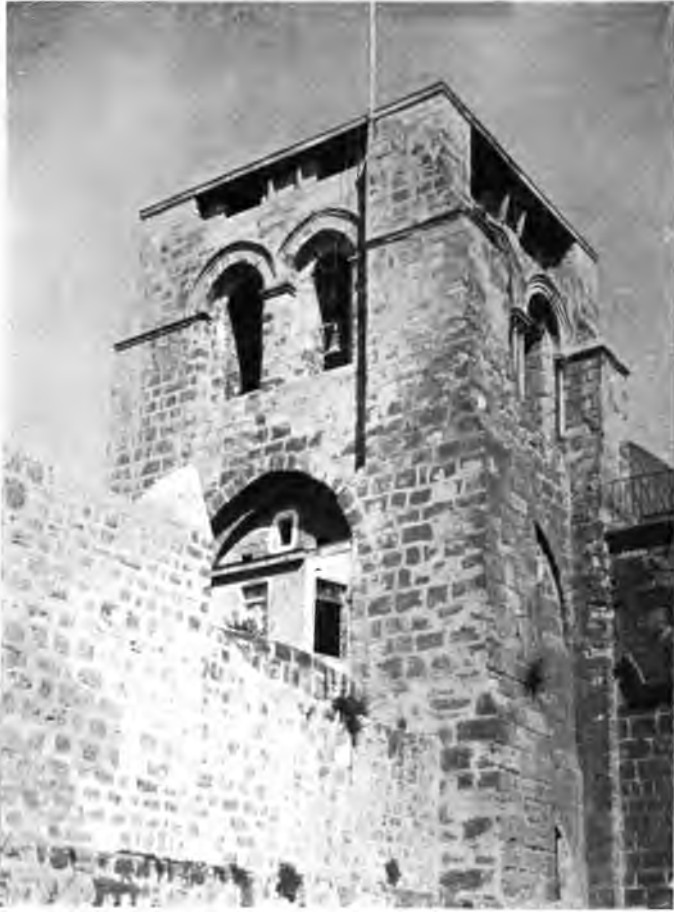
BELFRY OF THE CHURCH OF THE HOLY SEPULCHRE